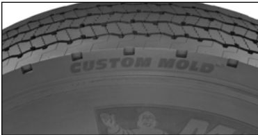
Custom Mold™ X® LINE ENERGY D

Seamless, Splice-less, New Tire Appearance