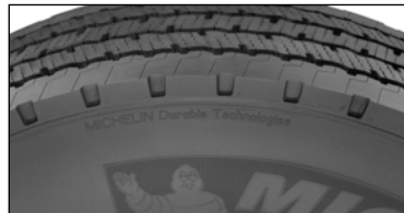
New Tire X® LINE ENERGY D