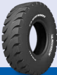
MICHELIN® XD MINeworks