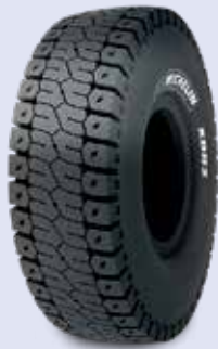
MICHELIN® XDR® 3

No matter what your 100-ton application needs are, Michelin has the 49" tire to keep your machines moving.