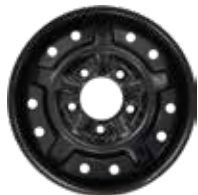
MSPN 49265 & 10545

Note: All UTV/ATVs use 60° / Conical / Tapered Lug Nuts.