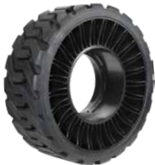
2-Piece Hub X TWEEL SSL shown without a hub adapter installed