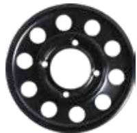
MSPN 21709 & 29242