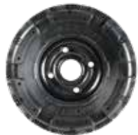
MSPN 68495, 67693, 65492, 64998 & 03488