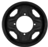
MSPN 75085 & 82599