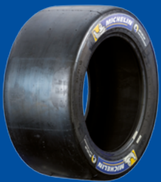
SLICK MEDIUM - HARD